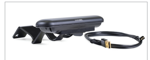
UV Angel Kit for StyleView Keyboard 98-525-085

Source: "Evaluating the Utility of UV Lamps to Mitigate the Spread of Pathogens in the ICU." https://doi.org/10.1101/2020.04.29.20085704