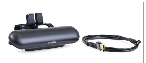
UV Angel Kit for StyleView Worksurface 98-526-086