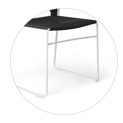
-WHT White glides are standard.