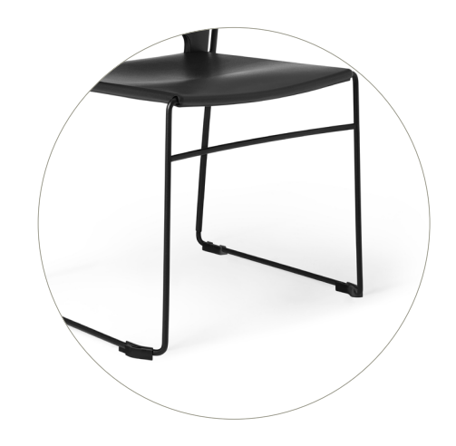
-BLK Black glides are standard.