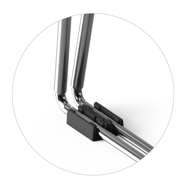
Push straight down to engage ganging device