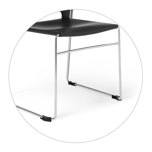
-CHM Frame finish is most durable option for frequent stacking/unstacking. Black glides are standard.