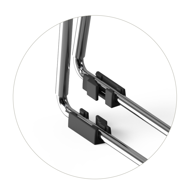
Lift chair to be ganged just over the chair next to it