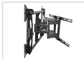
AM175 offers flat-panel displays 10° of tilt and 45° of swivel