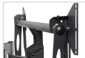
Patented Griplates™ hold the display tight on its mounting brackets