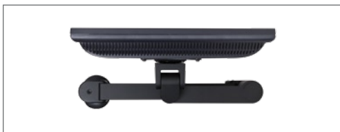
Folds flat to save maximum space