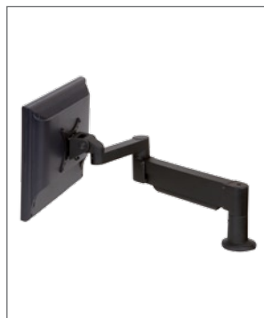
Rotates 360 degrees at three joints