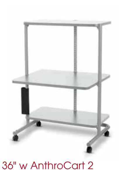
The perfect building blocks, AnthroCarts are easy to configure for your equipment, shown with optional Additional Shelf and Extension Tubes.