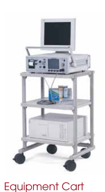
Keep your small equipment on the move with a compact mobile Equipment Cart. Shown with optional Additional Shelf and Extension Tubes.