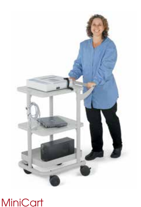
Add the optional Handle, Metal Bin, and 4" Casters for a nimble cart that can maneuver through tight spaces.