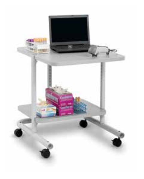
24" w AnthroCart 2 The 24"w AnthroCart makes a compact desk for laptops.