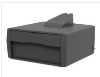
TALL SINGLE DRAWER DARK GREY 97-989-622

Additional accessories available in white