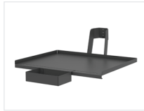
FRONT SHELF DARK GREY 98-417-282