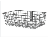
LARGE WIRE BASKET DARK GREY 98-135-282