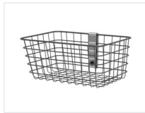
SMALL WIRE BASKET DARK GREY 98-136-282