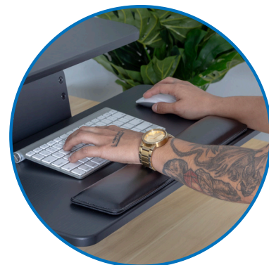
Soft wrist support