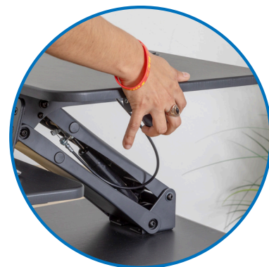
Gas spring height adjustment