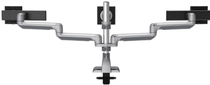
E5 TRIPLE STATIC POLE Screen Size: Up to 27" Weight Capacity: 0-20 lbs. per monitor Part Number: E5-P03SS-__