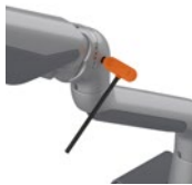
Rotation and friction adjustments are made externally