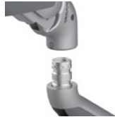
Universal connections enable easy reconfiguration

E5 ensures easy assembly and seamless future adaptability. Whether you're mounting a 5, 20 or 40-pound monitor, one single E5 monitor arm has you covered. Not only does this eliminate the cost of installing an entirely new setup, but E5 makes the entire specification process easy and hassle free. The future never looked so good.