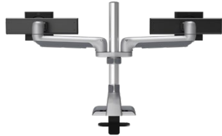
E5 DUAL STATIC POLE Screen Size: Up to 32" Weight Capacity: 0-25 lbs. per monitor Part Number: E5-P02S-__