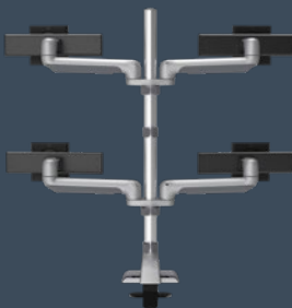
Two Over Two Static Pole E5G-P22S-XXX Weight Range: 0-15 lbs. per monitor Monitor Size: Up to 27"