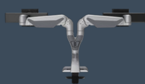
Dual Dynamic E5-D2-XXX Weight Range: 0-25 lbs. per monitor Monitor Size: Up to 32"