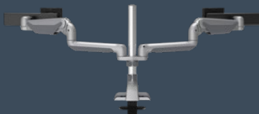
Dual Dynamic Wide Pole E5G-P02SD-XXX Weight Range: 0-20 lbs. per monitor Monitor Size: Up to 44" bezel measured