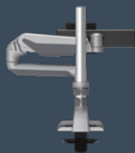
Single Dynamic Pole E5G-P01SD-XXX Weight Range: 0-25 lbs. Monitor Size: Up to 49"