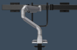
Dual Crossbar Dynamic E5G-D2C-XXX Weight Range: 0-20 lbs. per monitor Monitor Size: Up to 32"