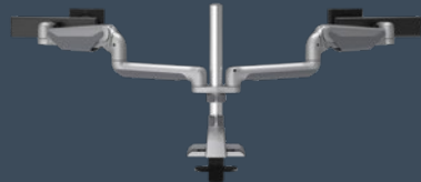
Dual Dynamic Wide E5G-D2SD-XXX Weight Range: 0-20 lbs. per monitor Monitor Size: Up to 44" bezel measured