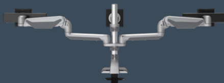
Triple Dynamic Pole E5G-P03SD-XXX Weight Range: 0-20 lbs. per monitor Monitor Size: Up to 27"