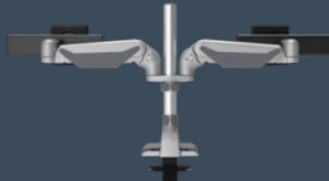
Dual Dynamic Pole E5G-P02D-XXX Weight Range: 0-25 lbs. per monitor Monitor Size: Up to 32"