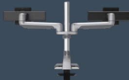
Dual Static Pole E5G-P02S-XXX Weight Range: 0-25 lbs. per monitor Monitor Size: Up to 32"