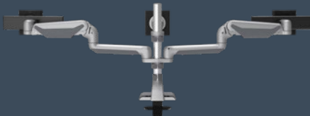
Triple Dynamic Pole E5G-P03SD-XXX

Weight Range: 0-20 lbs. per monitor Monitor Size: Up to 44" bezel measured