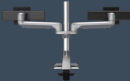
Dual Static Pole E5G-P02S-XXX

Weight Range: 0-15 lbs. per monitor Monitor Size: Up to 32"