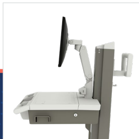
Flex Arm enhances visibility in transport and connection at the point of care