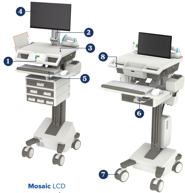
Mosaic LCD powered