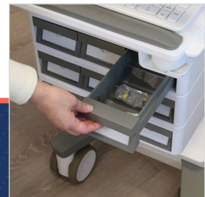
Smart security: Configurable, locking drawers for secure access