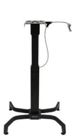
WorkFit-B Sit-Stand Base LD