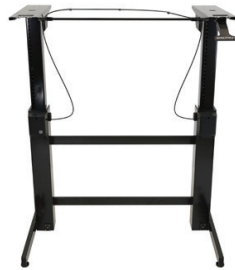
WorkFit-B Sit-Stand Base HD