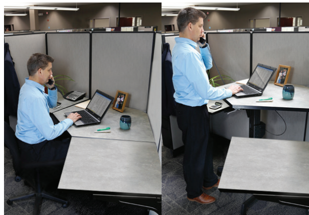
Sit-stand office cube with WorkFit-B LD installation using existing worksurface

Features up to 20 inches (51 cm) of vertical motion—patented CF technology allows instantaneous, tool-free, non-motorized re-positioning while you work! Integrated brake secures table in place and with just a touch releases for height adjustment.