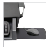
Mouse Tray Upgrade Kit 97-805-055 (black) For older versions of StyleView Sit-Stand Combo Arm with Worksurface