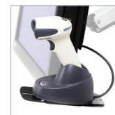
Scanner Shelf, VESA Attach 97-815 (black) 97-815-062 (white)