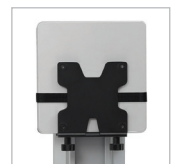
Thin Client Mount 80-107-200 (black) 80-107-216 (white)

© 2015 Ergotron, Inc. rev. 10/29/2015/EA Literature made in the U.S.A. Content is subject to change without notification