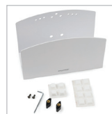
CPU Holder Small: 80-063-200 (black) 80-063-216 (white) Medium: 97-468-202 (silver) 97-468-216 (white)