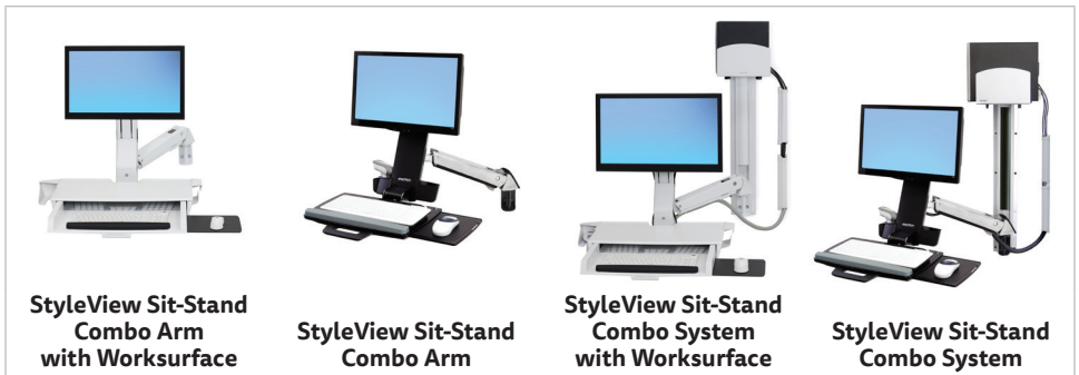
StyleView Sit-Stand Combo Arm with Worksurface