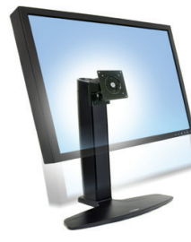
Neo-Flex Widescreen Lift Stand