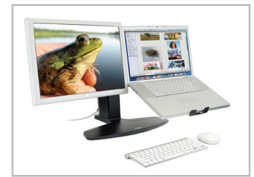
Neo-Flex Combo Lift Stand supports a display next to a laptop computer, positioned on the left or right side. Use with a separate keyboard and mouse (not included)

© 2015 Ergotron, Inc. rev. 09/21/2015/EA Literature made in US Content is subject to change without notification