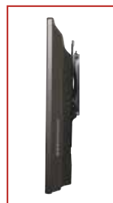
Low-profile design for a sleek, yet compact installation