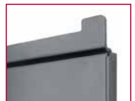
Specially designed safety tabs for secure support