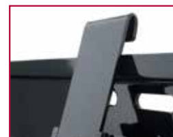
Easy hook-on design

* Designed exclusively for use with ultra-thin displays 2" (51mm) deep or less