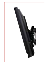
One-touch tilt adjustment of +15/-5°

Open wall plate design provides easy access and pass through of cables to internal and external power and content sources