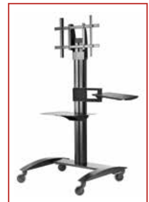
For use with Peerless-AV® SmartMount® flat panel carts or stands