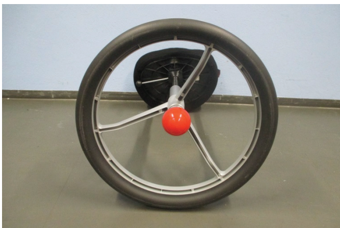
Pic 3: Bottom up view