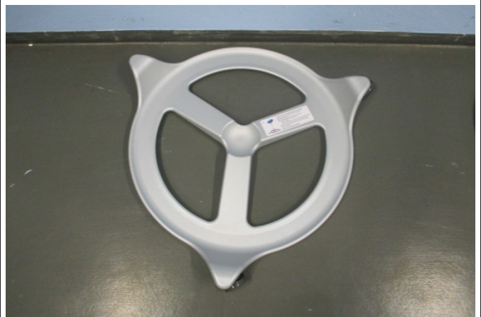
Pic 2: Castor base