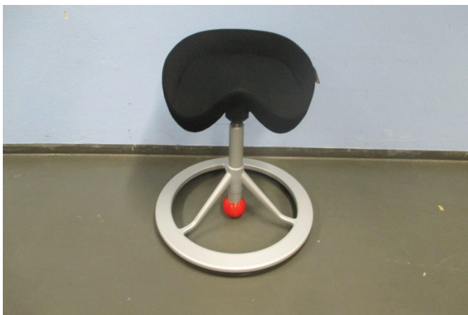
Pic 1: Front view