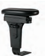
KR-251M Memosoft arm pads Ultra mobility arms with extension

Pneumatic lift Tilting backrest EZ back height adjustment Seat tilting Sliding seat Fabric panel back