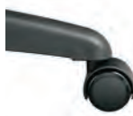
Self Braking Safety For smooth surfaces, restricts rolling when user is not seated.