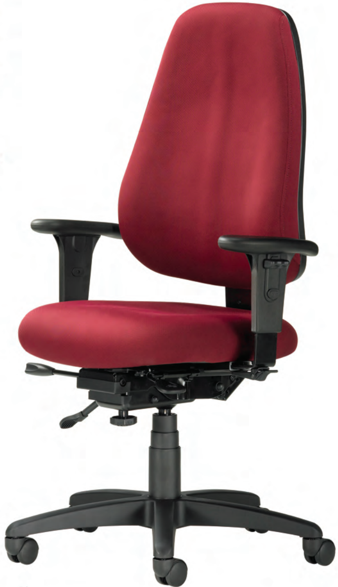
PC59 SHOWN WITH KR-240 ARMS