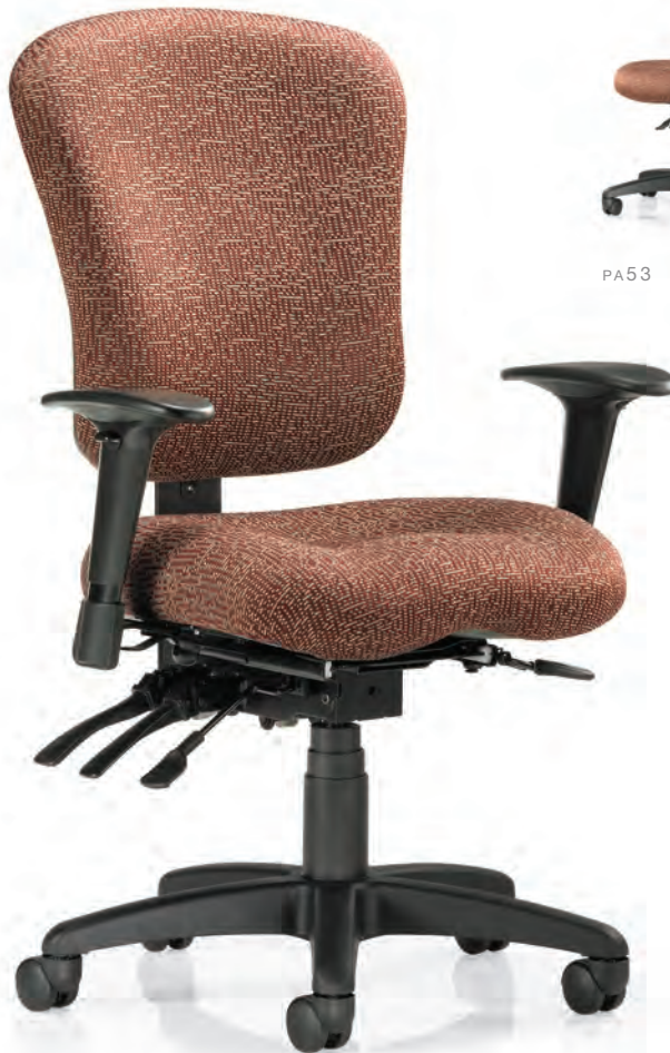
PA55 SHOWN WITH JR-37 ARMS