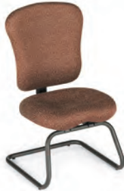
PA61S Guest Chair

Pneumatic lift Tilting backrest EZ back height adjustment Seat tilting Sliding seat