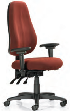
PA59 SHOWN WITH JR-40M ARMS