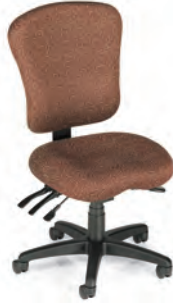
PA55 Management Chair

Pneumatic lift Tilting backrest EZ back height adjustment Seat tilting Sliding seat