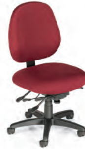
PC53 Task Chair