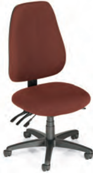
PA59 Executive Chair