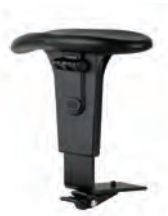
KR-240 Contoured arm pads Lowest height and width adjustable