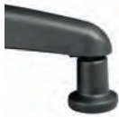
Glider For any surface, keeps chair or stool stationary.

Pneumatic lift Tilting backrest EZ back height adjustment Seat tilting Sliding seat Rocking tilt Infinite forward tilting Tension knob Fabric panel back