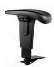
KR-200 Contoured arm pads Height and width adjustable