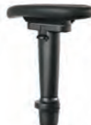
JR-40M Finger grip, Memosoft armpads Four way adjustable