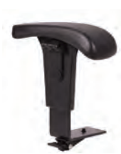
KR-300 Contoured arm pads Tallest height and width adjustable