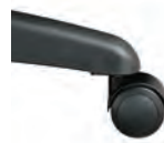
Reverse Braking For smooth surfaces, locks when user is seated.