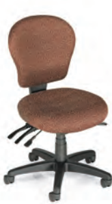
PA53 Task Chair