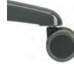
Dual Color Soft Caster For any surface, reduces surface marking.