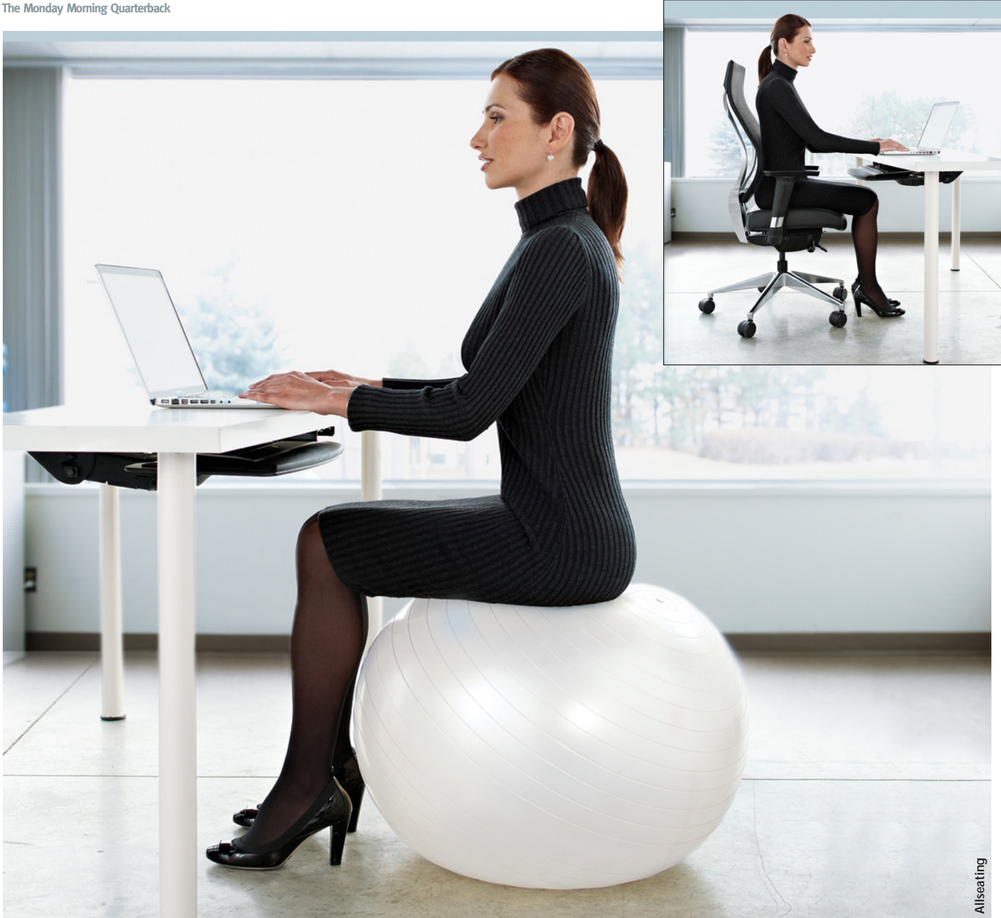
March 7 - 13, 2011 The Monday Morning Quarterhack

Ask Herman Miller how seating will evolve and they will tell you through the use of new materials. Ask Steelcase how seating will evolve and they will tell you it will happen by the careful study of how people work. Ask Humanscale how seating will evolve and they will tell you through simplicity of form and function.