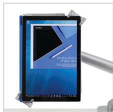
Recommended accessory: Lockable Tablet Mount secures tablet to tablet arm (#45-460-026)