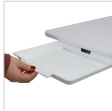
Pull-out drawer stores small personal items