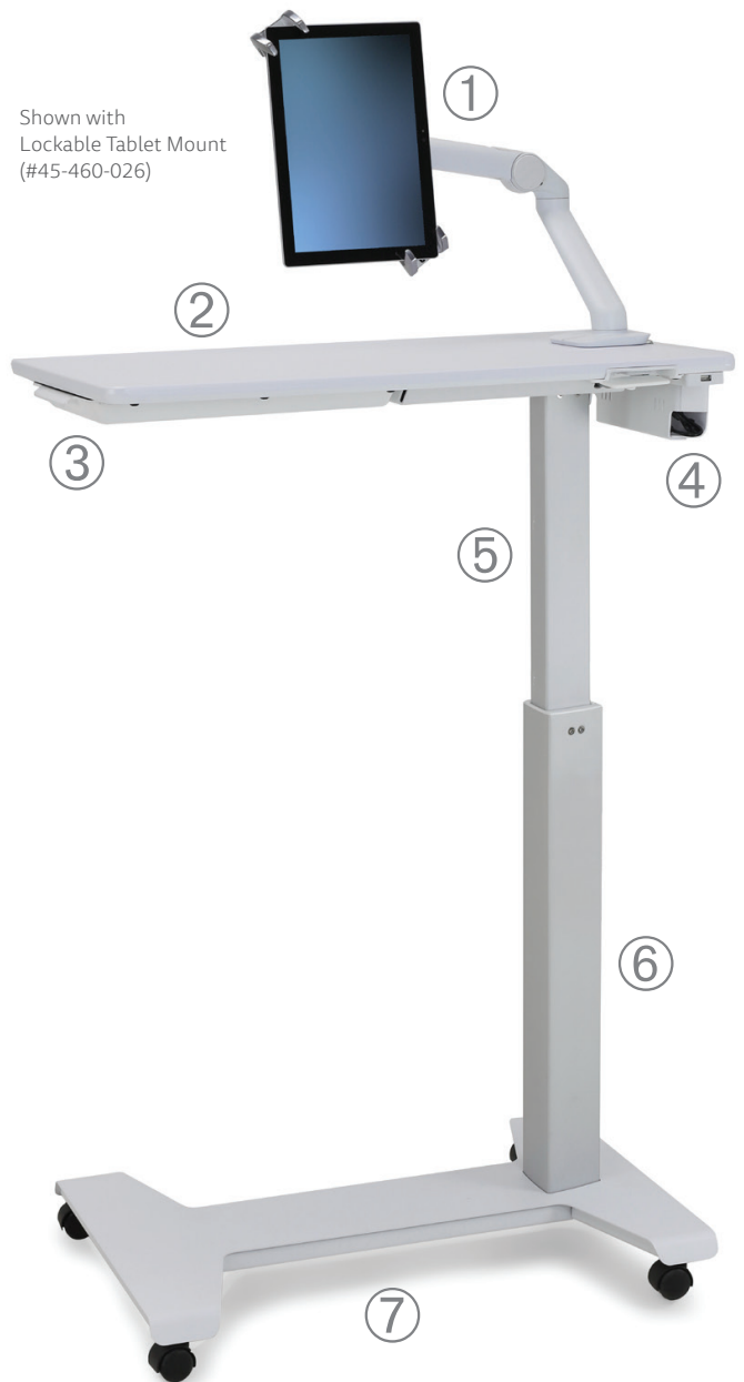
Shown with Lockable Tablet Mount (#45-460-026)