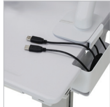
Tech Bay stores 2 USB cables to charge devices