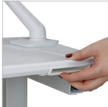
Easily lift or lower eTable with the simple squeeze of a lever from either side of the eTable