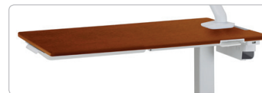
Dark Cherry surface