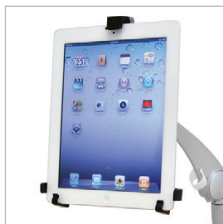
Recommended accessory: Universal Tablet Cradle when tablets are provided by patients (#80-106-085)