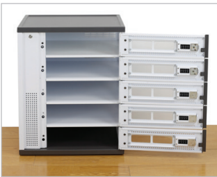
Five bays support up to 15 devices