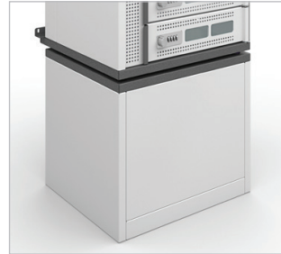
The Charging Locker Pedestal accessory elevates the Charging Locker off the floor by 18" (45 cm) making it easier to reach the bays (#98-137-A68)