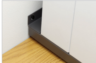
A bracket attaches Charging Locker to wall or desktop for added security