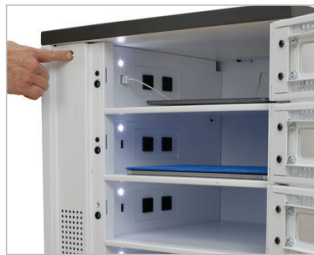
All bays light up with a simple push of a button