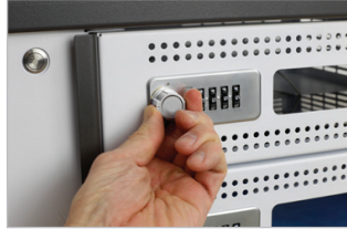
Programmable lock uses 4-number combinations as defined by users