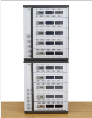
Stack and secure two lockers together to save space