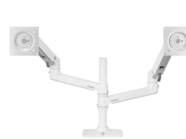
LX Dual Stacking Arm