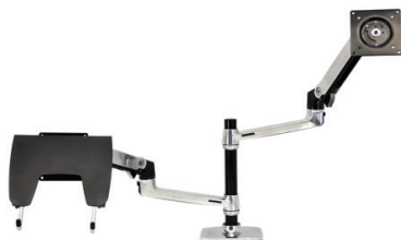
NOTEBOOK TRAY KIT SHOWN ABOVE IS INCLUDED WITH THE POLISHED ALUMINUM LX DUAL STACKING ARM #45-248-026

FOR ALL OTHER LX DUAL STACKING ARMS, THE NOTEBOOK TRAY KIT CAN BE ORDERED SEPARATELY #50-193-200 (AVAILABLE IN BLACK ONLY)