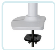
INCLUDED WITH LX DUAL STACKING ARM, TALL POLE: GROMMET MOUNT KIT ATTACHES THROUGH SURFACE HOLE