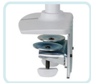
INCLUDED WITH LX DUAL STACKING ARM, TALL POLE: HEAVY-DUTY 2-PIECE DESK CLAMP ATTACHES TO SURFACE EDGE