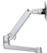
SILVER WITH WHITE ACCENTS #98-130-231