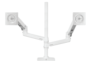
LX Dual Stacking Arm, Tall Pole