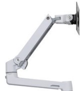
WHITE WITH GREY ACCENTS #98-130-216