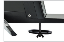
Grommet Mount 97-649-085