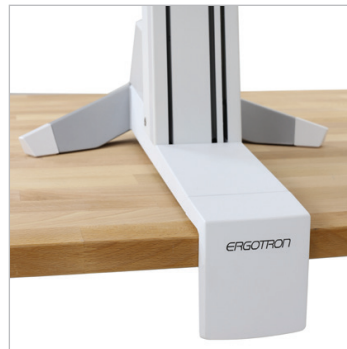
Clamps to the front of surface