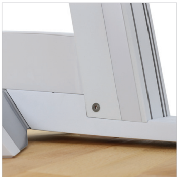
Solid base provides strong stability