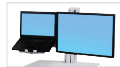
WorkFit Conversion Kit: Dual to LCD & Laptop (white) 97-938-062 Converts a WorkFit-S, Dual into an LCD & Laptop Workstation