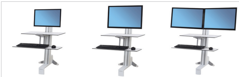
WorkFit-S, Single LD with Worksurface+