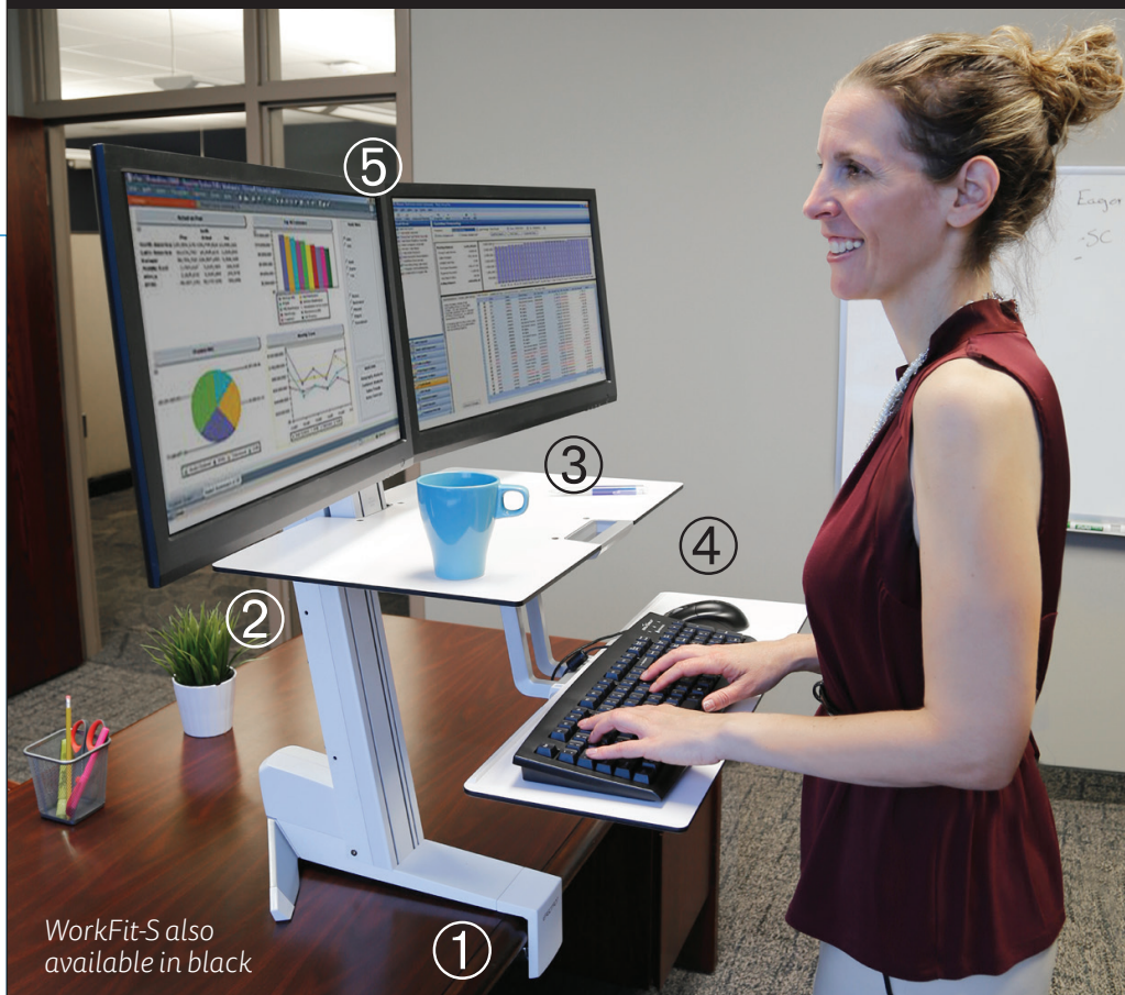
WorkFit-S also available in black