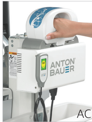
SV Hot Swap Power System