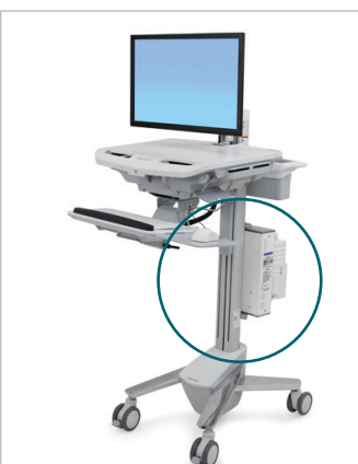
SV LiFe Power Upgrade System