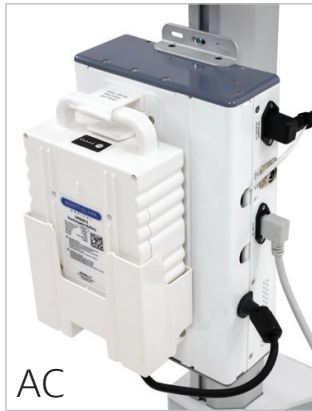
SV LiFe Power Upgrade System