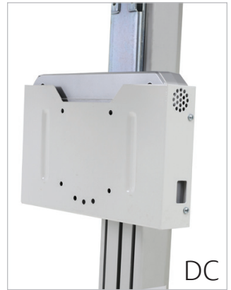
SV DC Power System