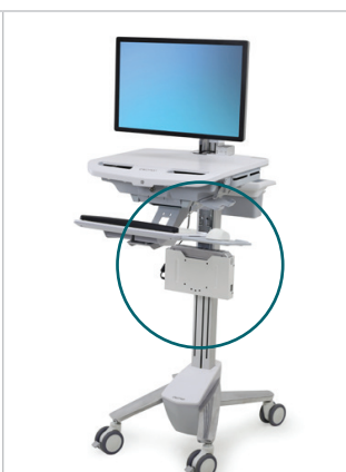
SV DC Power System