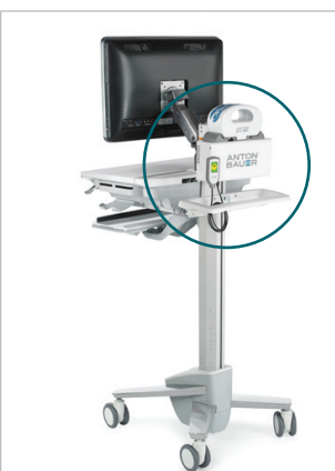
SV Hot Swap Power System