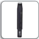
CMS EXTENSION COLUMNS