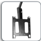
PCM™ 42 - 71" Single Ceiling Mount with Angled Column