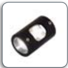
CMA STRUCTURAL ADAPTERS