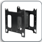
PDC™ 42 - 71" Dual Ceiling Mount