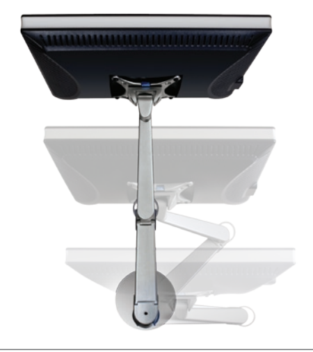
Extends 16" and folds flat to save maximum space