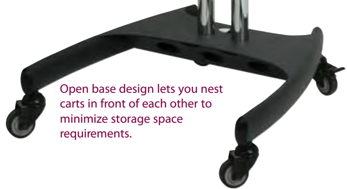
Open base design lets you nest carts in front of each other to minimize storage space requirements.