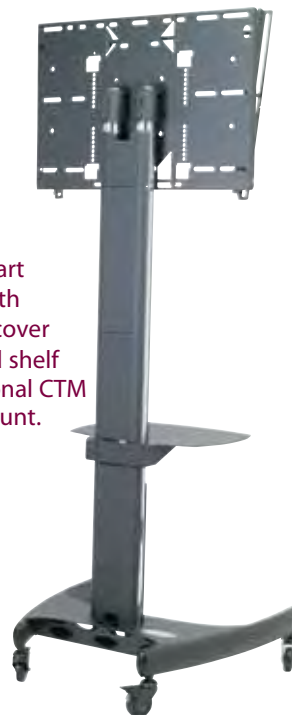
Nesting cart shown with optional cover packs and shelf and optional CTM Series mount.