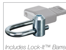
Includes Lock-It™ Barrel

Can be installed on 16", 18", 24" and 32" studs