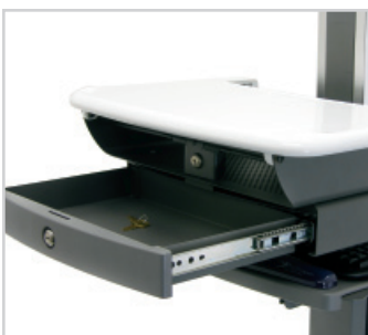
Lockable notebook drawer (shown open) can be used for storage of supplies.