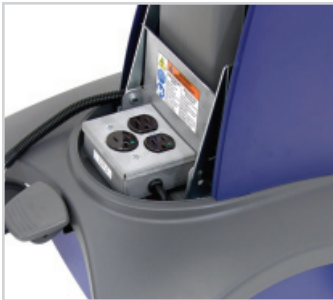
StyleView Power System includes three hospital grade AC power outlets that provide CPU, LCD, notebook and tablet PCs with ample power.