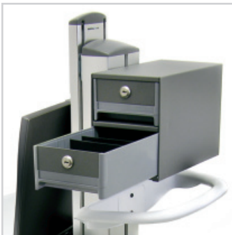
Medication drawers lock and keep medicine nearby for improved workflow.